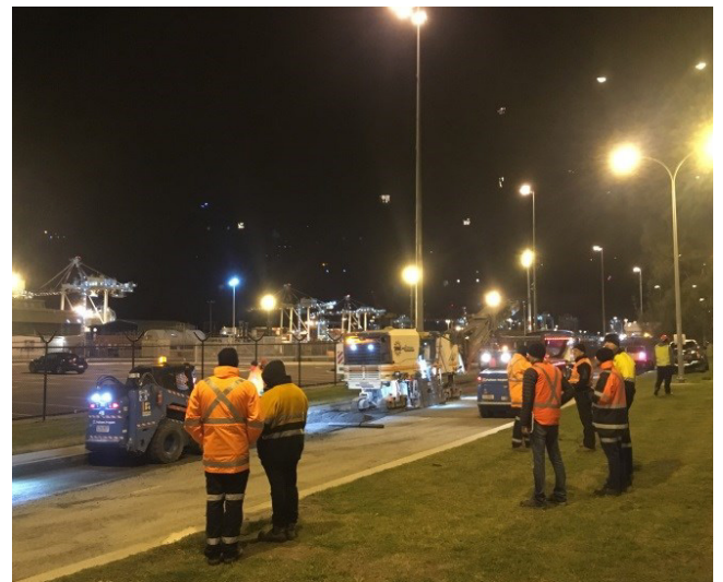
EME2 being placed at the Port of Brisbane enabled Fulton Hogan to deliver a successful pavement, overcoming a number of challenges including time constraints, weather conditions and environmental concerns; whilst reducing costs and assuring quality.

EME2 asphalt creates a pavement designed for heavy traffic loads that is thinner than conventional asphalt, by using a stiffer binder at a higher content in the asphalt mix. This relatively high binder content provides enhanced elasticity in response to repetitious wheel loadings. EME2 is placed with low air voids (-6%) to provide high durability and performance under heavy traffic loads.