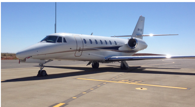
JetBloc offers superior fuel resistance compared to other standard asphalt surface treatments.

JetBloc is applied in two even coats in transverse directions. As an emulsion based product, JetBloc has a shelf life of 3-6 months and should be stored between 10 and 40°C.