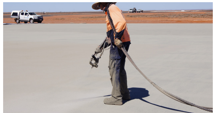
JetBloc is applied in two even coats in transverse directions.

For further information please email airports@fultonhogan.com or contact your nearest Fulton Hogan office. www.fultonhogan.com/contact_us